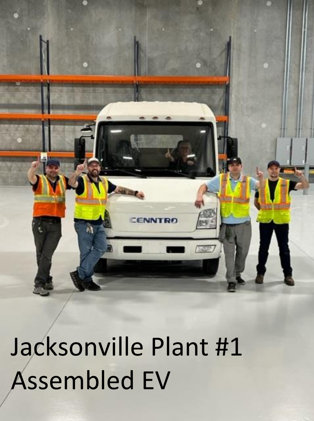
Jacksonville Plant #1 Assembled EV