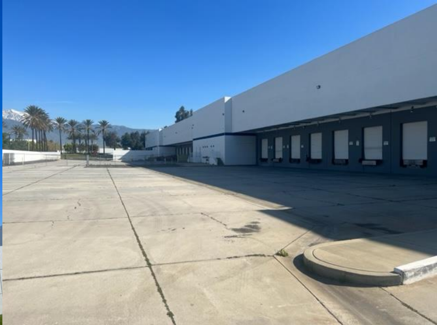
Ontario, California Plant/EV Center